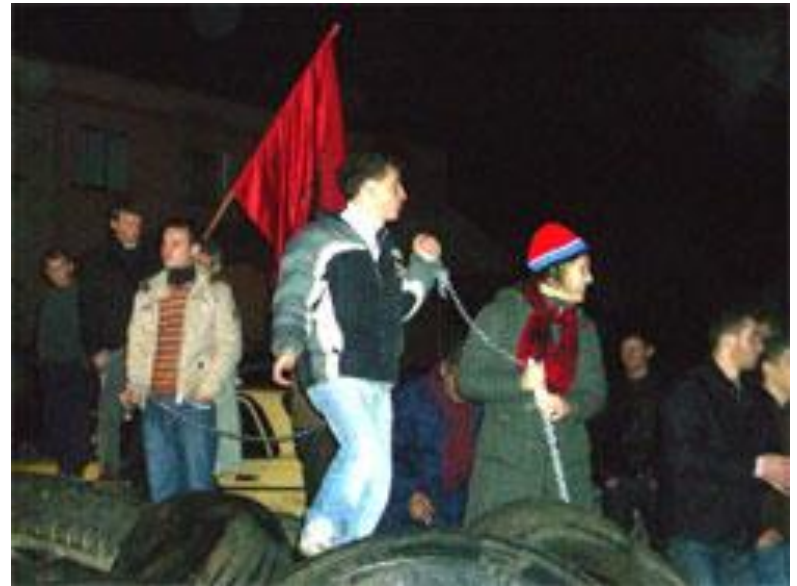
Alliance blocking the streets