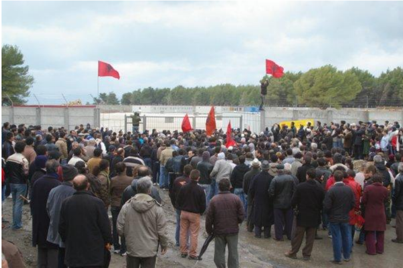
Alliance in front of the TPP